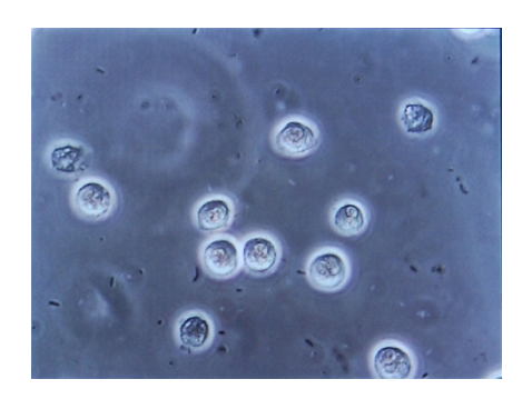
Fig 4: Multiple bacilli (rod-shaped bacteria, here shown as black and bean-shaped) shown between white blood cells in urinary microscopy. These changes are indicative of a urinary tract infection.

Multiple bacilli (rod-shaped bacteria, here shown as black and bean-shaped) shown between white blood cells in urinary microscopy. These changes are indicative of a urinary tract infection. straightforward cases, a diagnosis may be made and treatment given based on symptoms alone without further laboratory confirmation.[4] In complicated or questionable cases, it may be useful to confirm the diagnosis via urinalysis, looking for the presence of urinary nitrites, white blood cells (leukocytes), or leukocyte esterase.[12] Another test. microscopy, looks for the presence of red blood cells, white blood cells, or bacteria. Urine culture is deemed positive if it shows a bacterial colony count of greater than or equal to 103 colony-forming units per mL of a typical urinary tract organism. Antibiotic sensitivity can also be tested with these cultures, making them useful in the selection of antibiotic treatment. However, women with negative cultures may still improve with antibiotic treatment.[4] As symptoms can be vague and without reliable tests for urinary tract infections, diagnosis can be difficult in the elderly.[10]