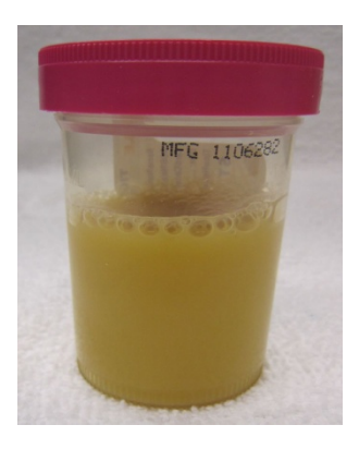
Fig 2: Urine may contain pus (a condition known as pyuria) as seen from a person with sepsis due to a urinary tract infection.

infection.Rarely, the urine may appear bloody or contain visible pus in the urine.